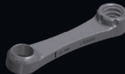
True NXS™ Rod