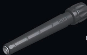
NXS™ Cap (on delivery tube)